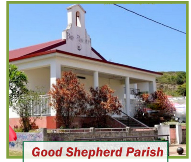
Good Shepherd Parish