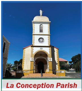
La Conception Parish