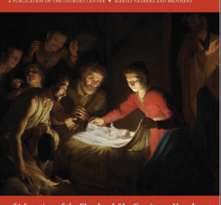
"Adoration of the Shepherds" by Gerrit van Honthorst (c. 1622)