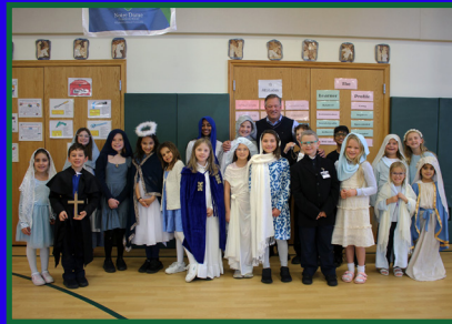
Founder's Week Celebrated

ND Academy 4 th graders delivered the canned and other non-perishable food collected for to Hands of Christ Duluth Cooperative Ministry and they also volunteered in the co-op! Notre Dame Academy families donated 2 pallets of food weighing over 1,100 lbs. plus 3 full grocery carts!