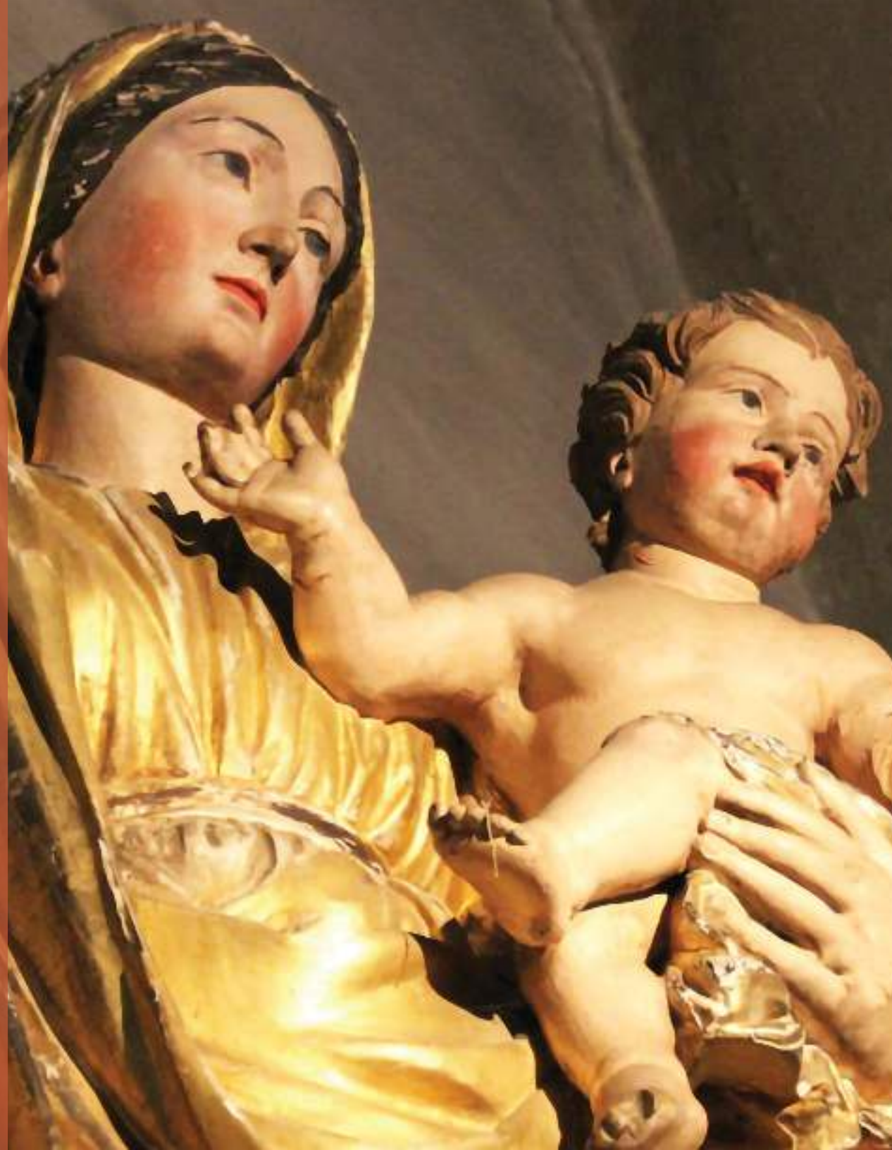
Photo: The young Fr. Colin prayed often before this statue of the Blessed Virgin and Child in the church of St John the Baptist, Cerdon, France seeking inspiration as he drew up the first rules of the Society of Mary.